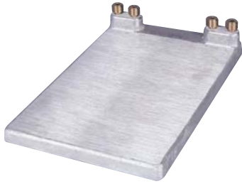
CP-1015-2 Shown with fittings #CP-BTF